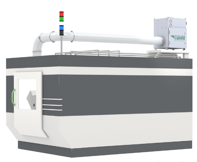
Integrated into machine tool